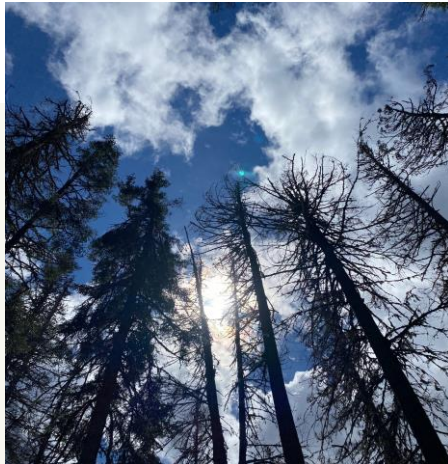
ENVIRONMENT AND SUSTAINABILITY