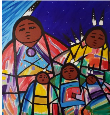
EQUITY, DIVERSITY AND INCLUSION